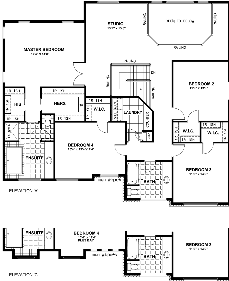
SECOND FLOOR PLAN 1985 SQ. FT. Includes 117 SQ. FT. OPEN TO BELOW AREA